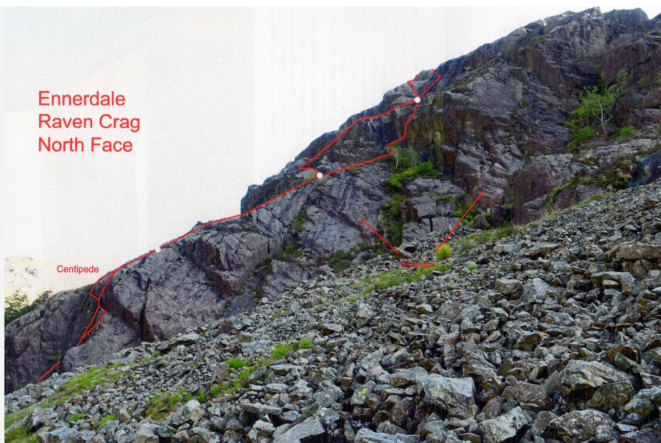
Raven Crag - Ennerdale (North Face)