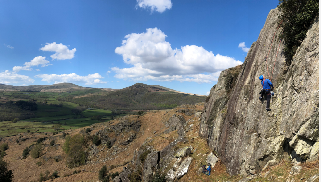
Cinder Hill Crag - Bonne Chance