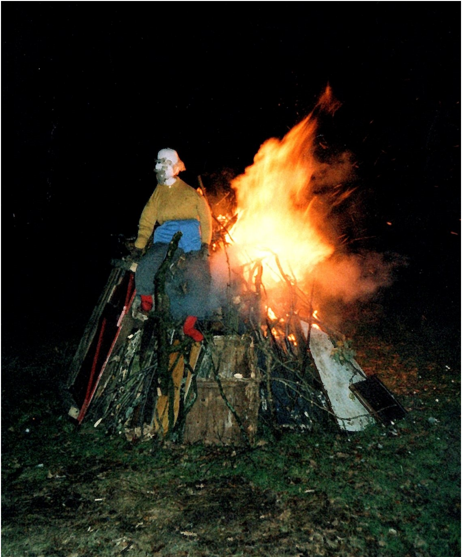
The Centenary bonfire, 2006