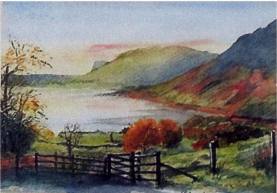
View down Wastwater, from the grounds of Brackenclose (from a painting by Lesley Comstive)