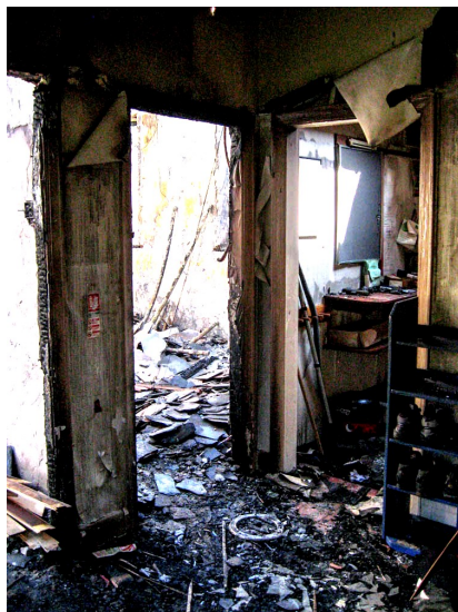
Damage at Brackenclose following the fire on 5 th April 2019: