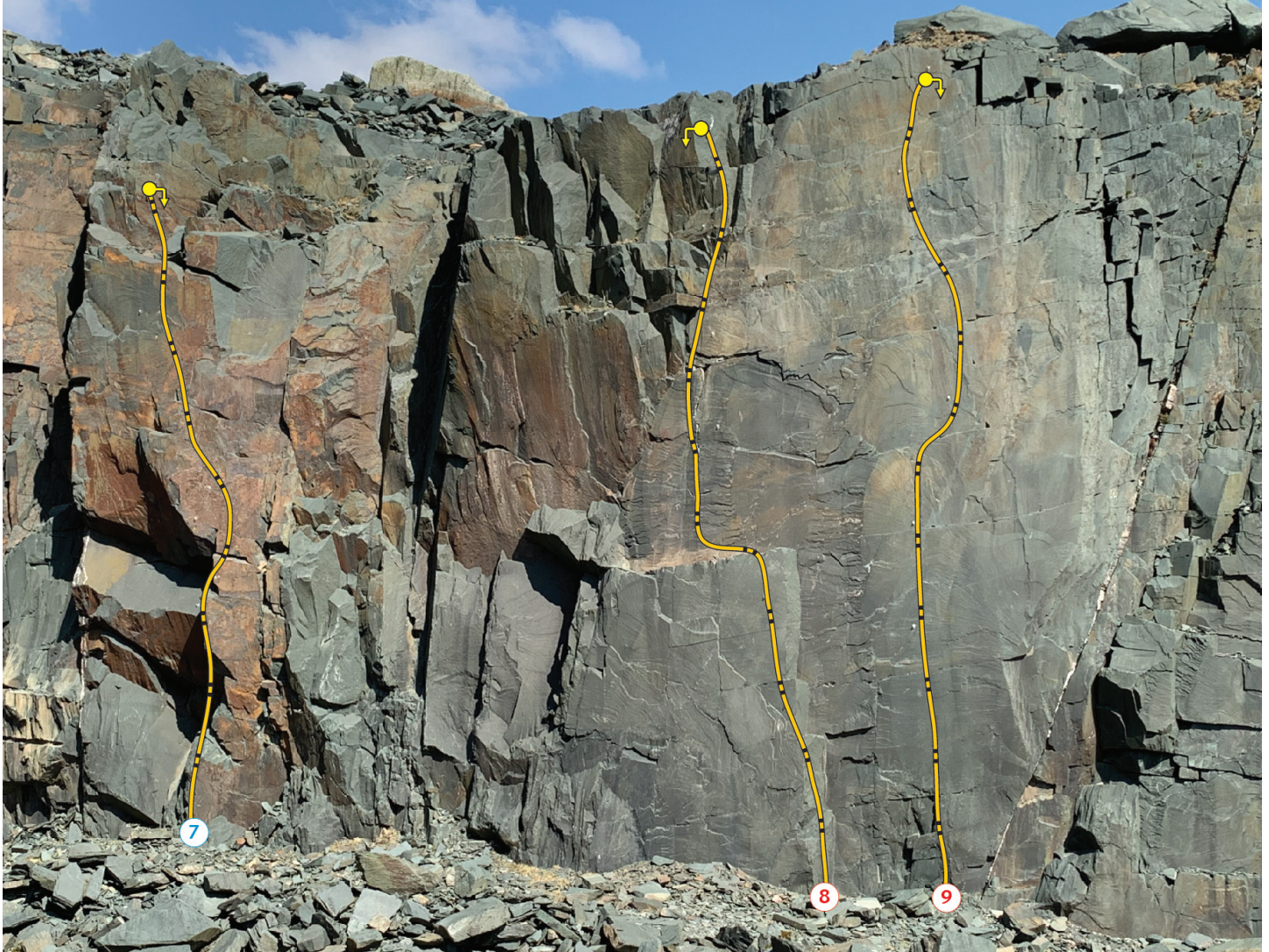
Bursting Stone Quarry RHS