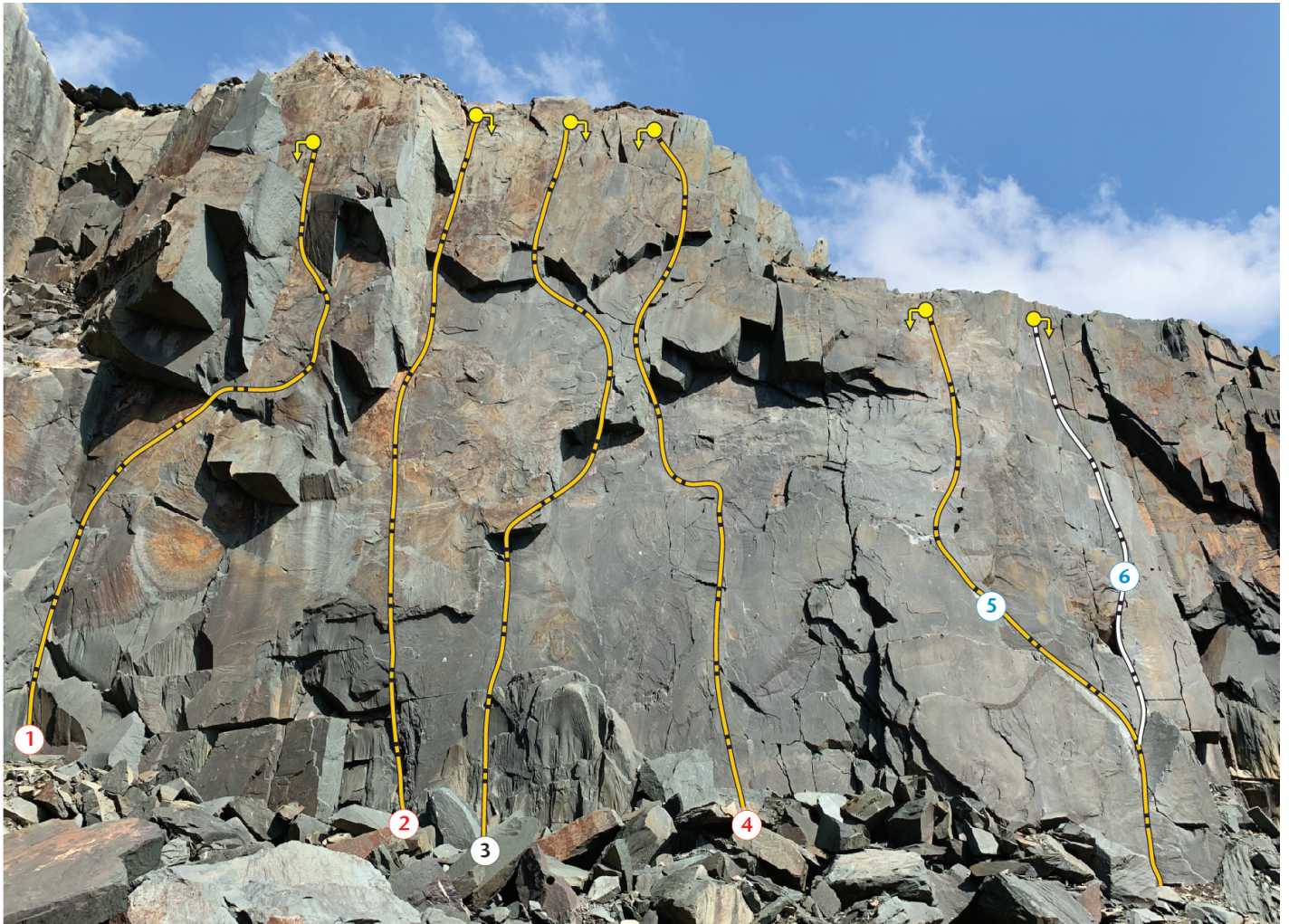
Bursting Stone Quarry LHS

All routes are fully bolted with lower-offs.