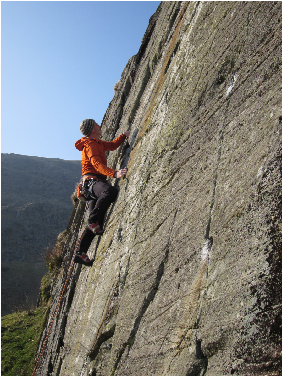
Pets Bridge Crag

TRADITIONAL Level 5 mins SOUTH-WEST facing