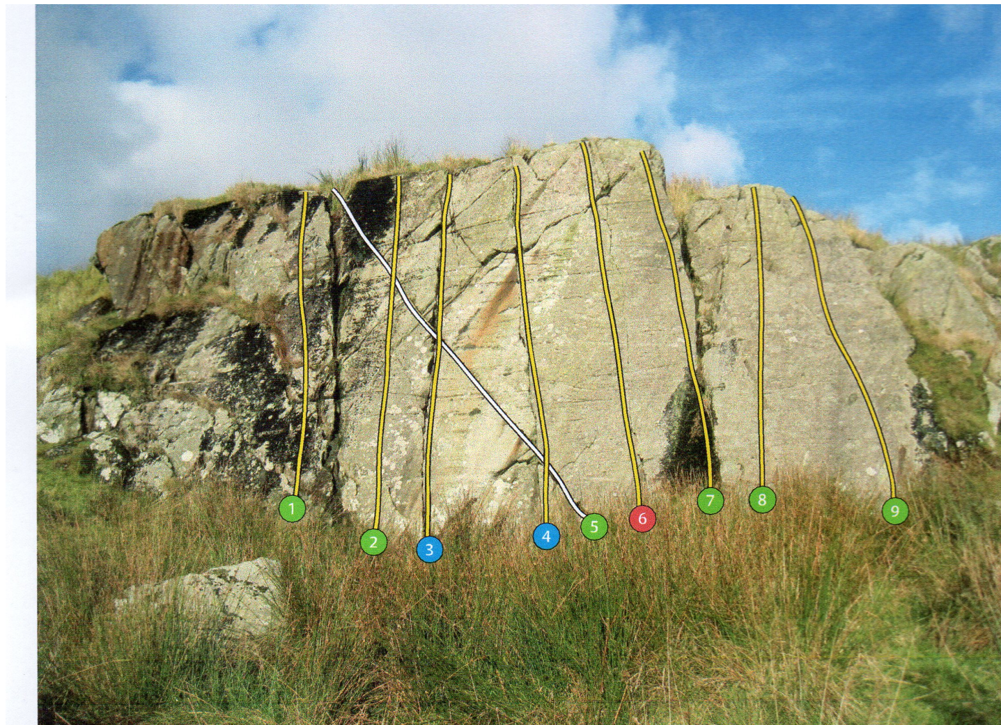
Pets Bridge Crag