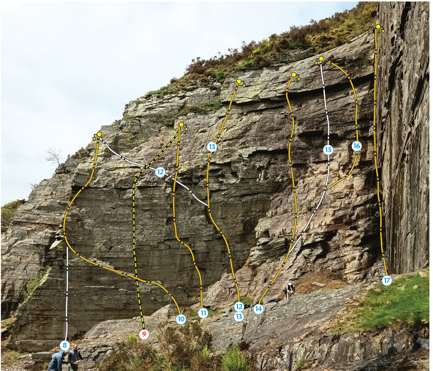
Scawgill Quarry Central

26.09.1991 A Evans, F West Originally HVS 4c - the only protection was an old in-situ peg - rebolted in 2021