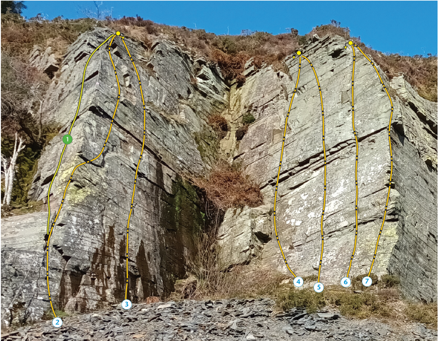
Scawgill Quarry LHS

Lat/Lng: 54.620510733086164, -3.2747265916879265