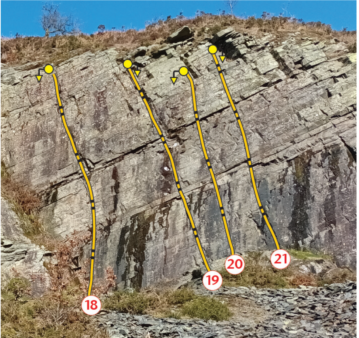
Scawgill Quarry RHS