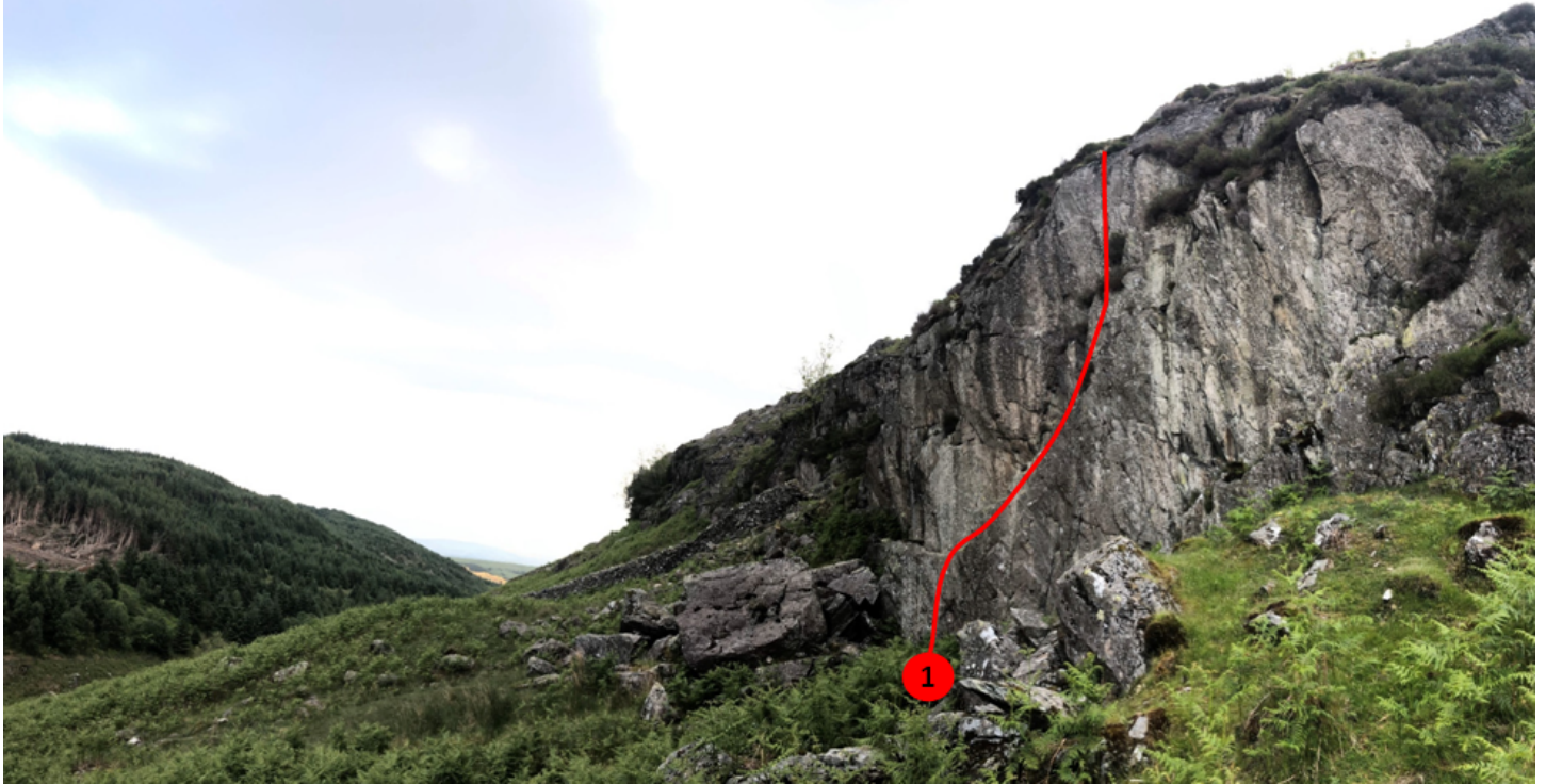
Lickle Crag - North

Approach as for Lickle Crag . then contour up the valley for about 100m, cross a gap in the dry stone wall and the North Crag is 50m further on.