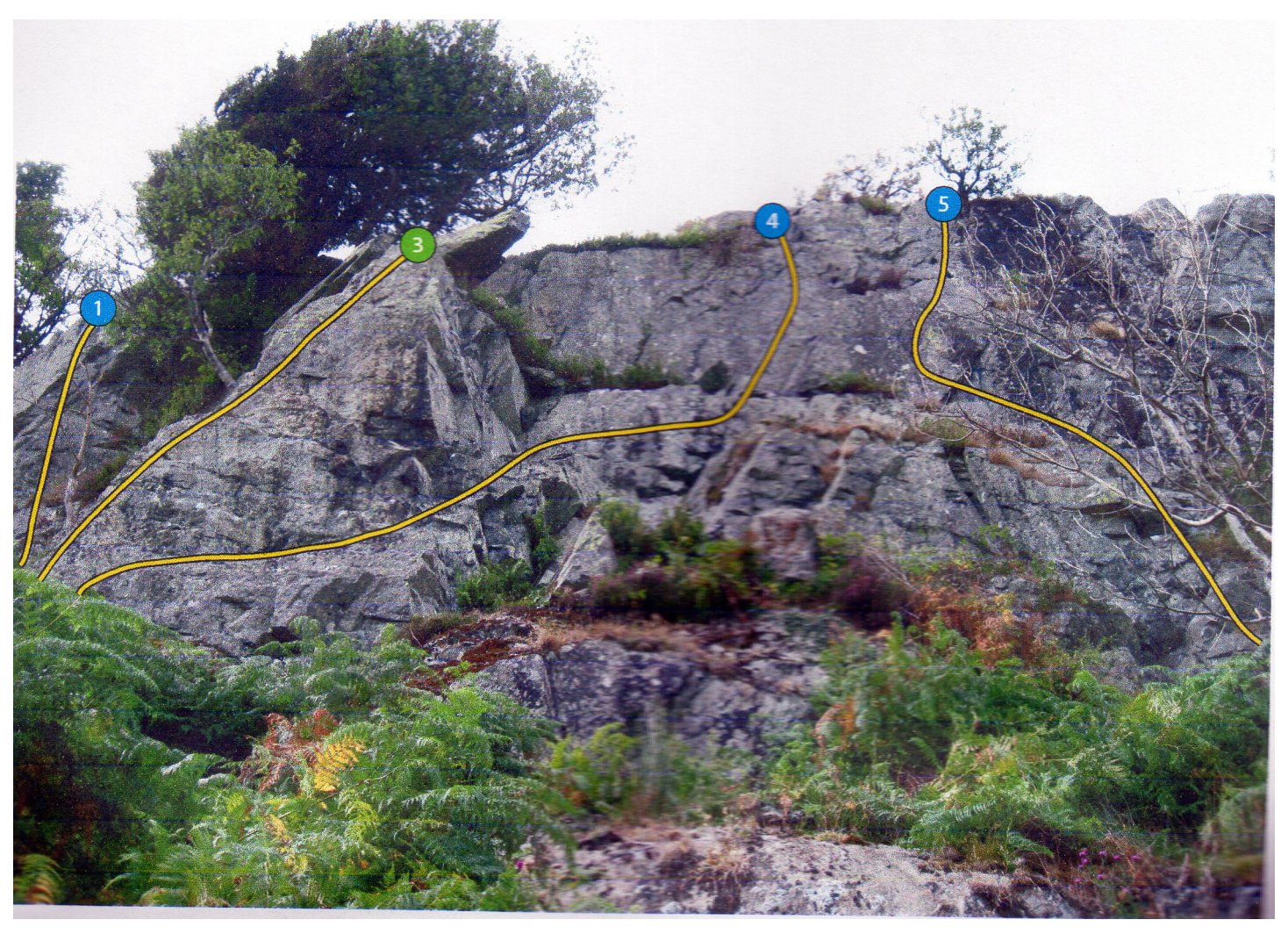
High Upper Scout Crag - LHS