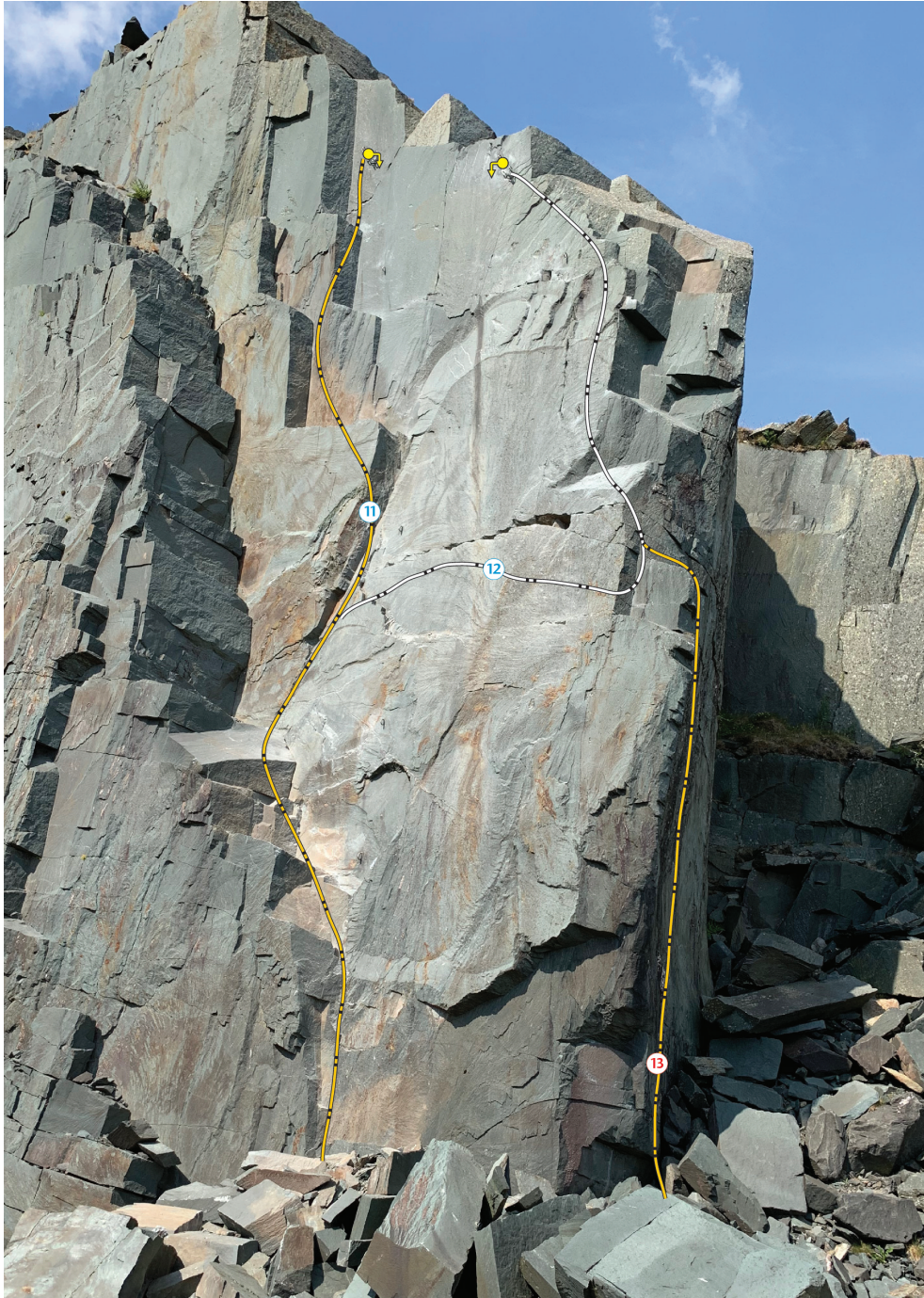
Bursting Stone Quarry RHS

The final 3 climbs lie well to the right, past a loose-looking section of rock, on a short wall by the entrance to the Main Wall of the quarry. The most prominent feature here is a left-trending broken corner and rampline.