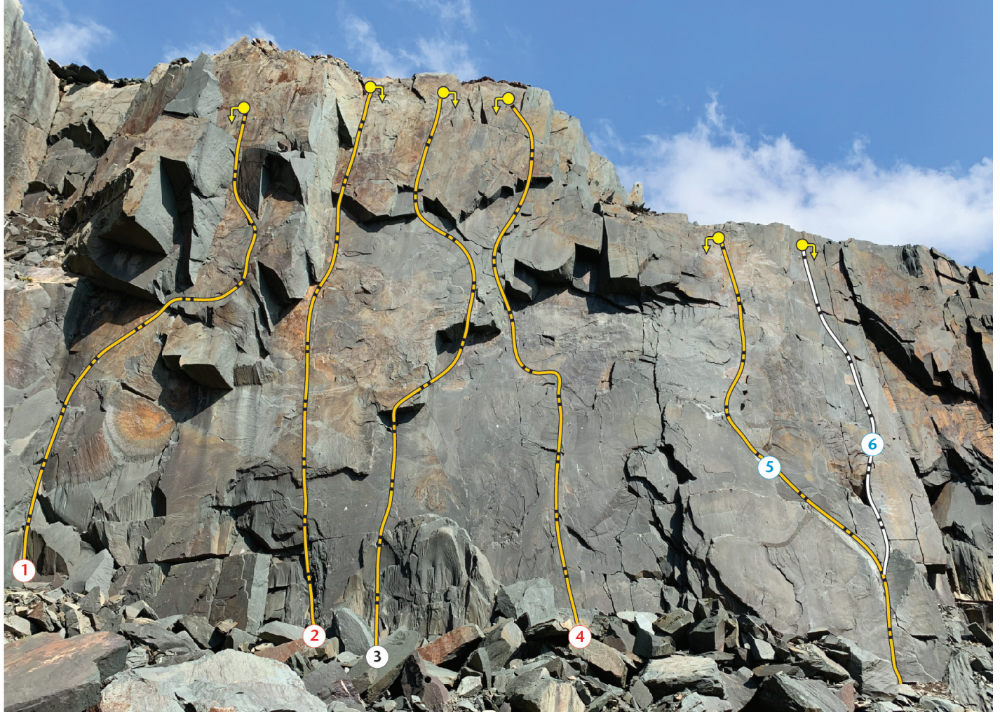
Bursting Stone Quarry LHS