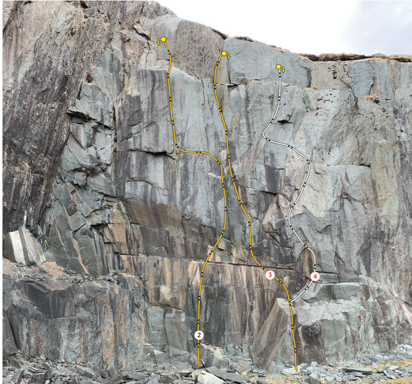
Bursting Stone Quarry Top Tier