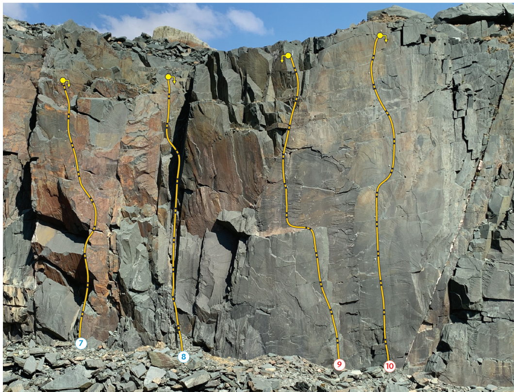
Bursting Stone Quarry - Centre

Starts 20m right beyond an unstable-looking red section of rock. Climb a steep groove, pulling out right to gain good ledges. Cross the wall leftwards to another ledge then up steeply to an awkward finish.